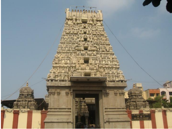
BALAJI TEMPLE AT NERUL

The mean annual temperature ranges from 25 to 28 °C. The mean maximum temperature of the hottest month in this area varies from 30 to 33 °C in April-May while mean minimum temperature of the coldest month varies from 16 to 20 °C. Extremes of temperatures, like 38 to 39 °C in summer and 11 to 14 °C in winter, may be experienced for a day or two in respective season.