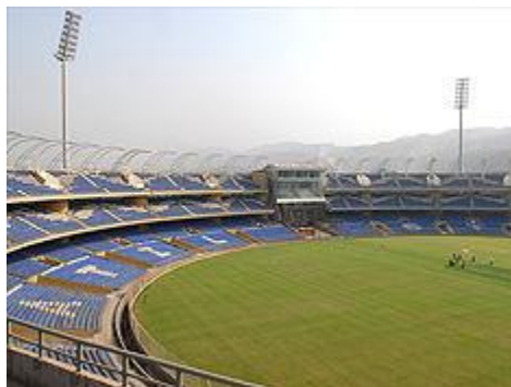
D Y PATIL INTERNATIONAL CRICKET STADIUM, NERUL.

Navi Mumbai , formerly known as New Bombay, is a twin city of Mumbai, India. It was developed in 1972, and is one of the largest planned cities in the world, with a total area of 344 km 2 and 163 km 2 under the jurisdiction of the Navi Mumbai Municipal Corporation (NMMC). Navi Mumbai lies on the mainland on the eastern seaboard of Thane Creek. The city limits stretch from Airoli near Thane in the north, to Uran in the south. The length of the city is almost the same as that of Mumbai. The Vashi and the Airoli Bridges connect Navi Mumbai to Mumbai. A new link between Nerul and Uran is under construction. The costliest and most developed areas of Navi Mumbai are Vashi and Nerul as a result Vashi is known as the king of Navi Mumbai while Nerul is considered as the queen of Navi Mumbai. Navi Mumbai has a population of 2,100,000 out of which 600,000 come from Nerul and 400,000 from Vashi, the remainder from Belapur, Kharghar and Koparkhairne and surrounding areas. Navi Mumbai is a part of the Mumbai Conurbation. NMMC is also rated amongst the richest corporations in Asia.